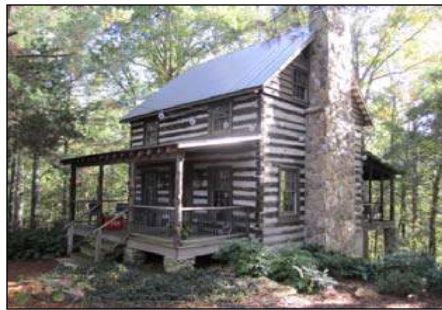
LYNCH CREEK FARM CABIN 1973 ROCKY FORD ROAD KITTRELL, NC 27544

SOCIETY MEMBERS MEET TO SHARE INFORMATION ABOUT OUR SERVICE PROJECTS. MEETINGS ARE HELD AT OUR CABIN HEADQUARTERS AT: